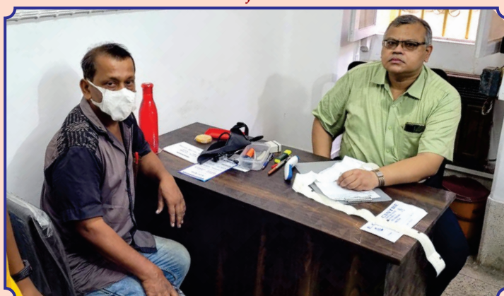
Project Ujjivan : Rotary Clinic on 07.08.22