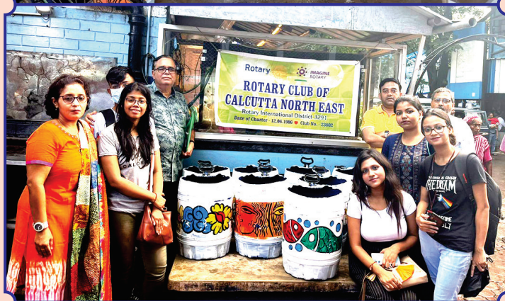
Rotaract Project : Clean Bin